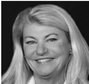
GEN. ANN E. DUNWOODY (RET.)

Gen. Ann E. Dunwoody (ret.) was named a director in August 2013. She retired as a four-star Army General in October 2012 after 37 years of historic and distinguished service. For the last four years of her service, she led the largest global logistics command in the Army, comprised of 69,000 military and civilian personnel located in 50 states and more than 140 countries. Gen. Dunwoody was responsible for the Army’s research and development, installation and contingency contracting, security assistance, supply chain management, and maintenance functions, supporting all Army depots, manufacturing sites, and ammunition plants. She managed a budget of $60 billion and was responsible for oversight of approximately $70 billion in service contracts. Gen. Dunwoody was the first woman in United States military history to achieve a four-star officer rank.